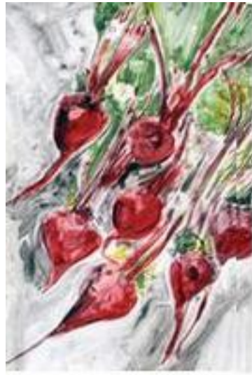
LuAnn Roberto melds graphic design with monoprinting in 10 new collections, including a series on vegetables.

"I think anybody in a creative position in textiles needs to be at Surtex," she added. "They'd be working in a vacuum otherwise."