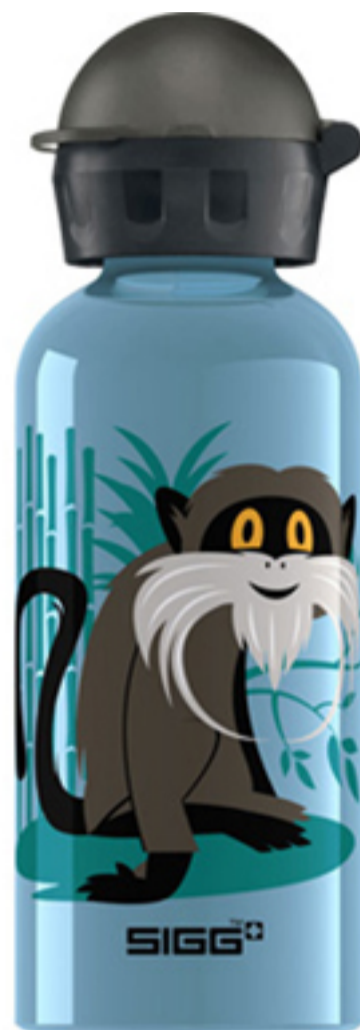
Cuipo's Cezar the Tamarin Monkey Sigg water bottle

Cuipo currently encompasses three distinct sub-brands: Cuipo Roots, a boutique apparel and accessories line; Cuipo Kids, a premium children's apparel and accessories line featuring a variety of playful and educational characters in a