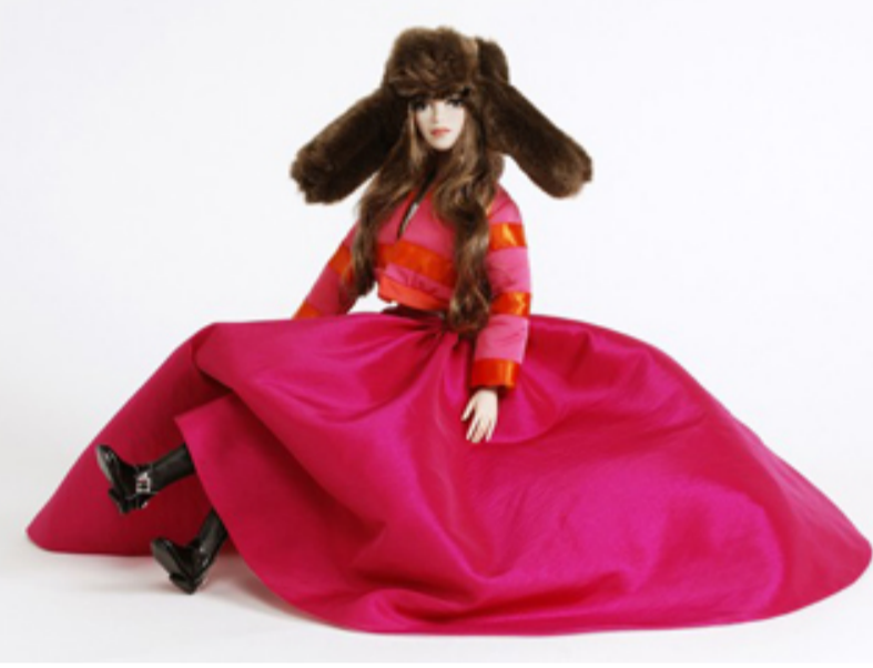
Madame Alexander's Isaac Mizrahi doll

Isaac Mizrahi/Madame Alexander Doll Co. Excel Brands has signed a licensing agreement with the Madame Alexander Doll Co. to develop a collection of dolls, doll apparel and accessories under the Isaac Mizrahi New York label.