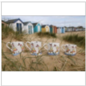
Suffolk Ceramics Studios Appoints Agent