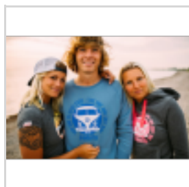
VW to Debut Licensing