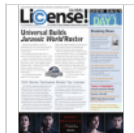
Be a Part of the BLE